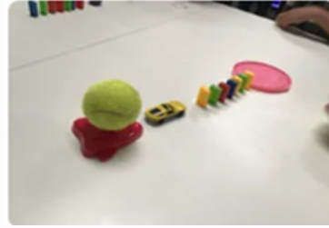
"Rube Goldberg machine" By Chucky, Kaile and Fenton