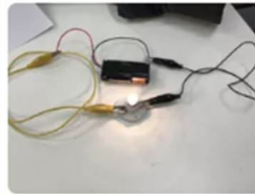
"Battery Holder" By Xavier, Soban, Zacky and Phoenix

IT WAS NATIONAL SCIENCE WEEK FROM THE 13TH TO THE 21ST OF AUGUST!!!!