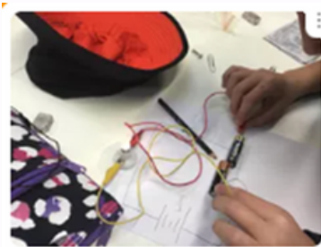
It worked! The light bulb lit up