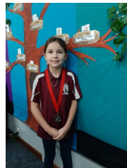
Year 3, 4 and 6 Champions and Runner Ups