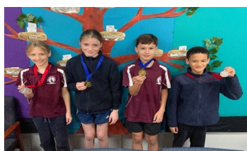
Year 5 Champions and Runner Up Champions