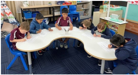
Busy doing handwriting

In English we have been doing lots of fun activities!