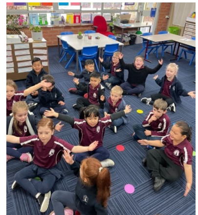
Talk 4 Writing